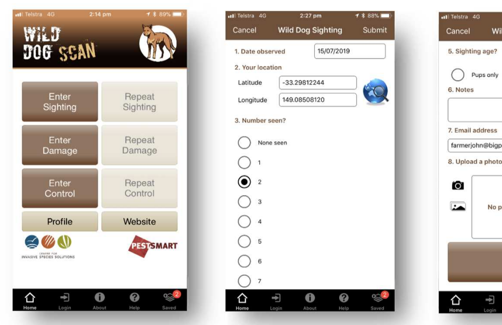
Option 2. Download the free Mobile App (Apple/Android).